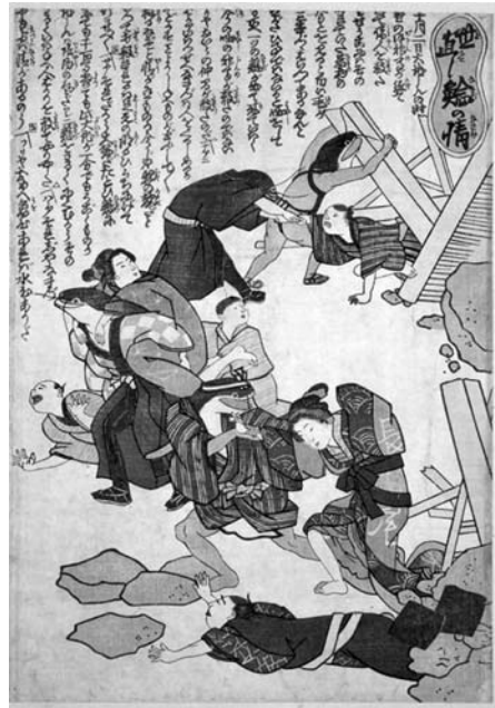
Figure 2 : Namazu working for the renewal of the society ( http : //www.bousaihaku.com/images/gallery/shake/cat19s.jpg )

Fukkou-bushi and Emergence of Volunteerism during the 1923 Great Kanto Earthquake : The dual-faceted nature of earthquake disaster narratives is also apparent from the 1923 Great Kanto Earthquake archives and literature. For example, a well-established and respected entrepreneur, Eiichi Shibusawa wrote that the earthquake was not only a peril but also heaven-sent retribution for the decay of morals and ethics in politics, business and mass media in the decadent post-World War I nouveau riche society (Shibusawa, 1923). A sentiment of rebalancing inequalities in the post disaster utopia was commonly shared among people. A street-ballad singer-songwriter, Tomomichi (a.k.a., Satsuki) Soeda popularized fukkou-bushi or the recovery ballad ( http : //locatv.com/gochisosan-fukkoubushi/ ) :