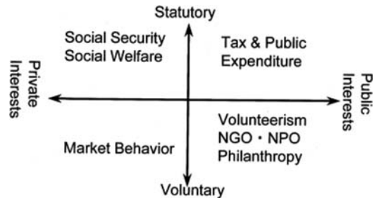
Figure 6 : Emergence of Public-Private and Statutory and Voluntary Axes