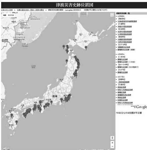
Figure 7 : Tsunami Disaster Historic Monument Map ( http://www.kasen.net/ishibumi/tsunamimap.htm , the last accessed on February 4, 2018)

Like Simeulue Island folklore as was illustrated earlier, similar cultural risk communication symbols against tsunami threats have been systematically surveyed and archived in recent years by formal disaster management agencies in Japan (see Figure 7). Each balloon on the map is linked to narratives associated with a given monument. For example, local residents near Taisho bridge in Osaka’s Naniwa ward gather around their tsunami monument every obon season (ancestral spirit homecoming day in August) in commemoration of the 1854 Ansei tsunami and they trace stone engraved lessons on early evacuations using freshly inked brushes. This practice is promoted extensively by Osaka city administration ( http://www.city.osaka.lg.jp/naniwa/page/0000000848.html ). The use of a tsunami monument as an indigenous seismic risk communication tool against tsunami threats has been recently gaining wide attention by disaster scholars (e.g., Kawashima, 2016; Hayashi, 2017; Sato et al, 2017).