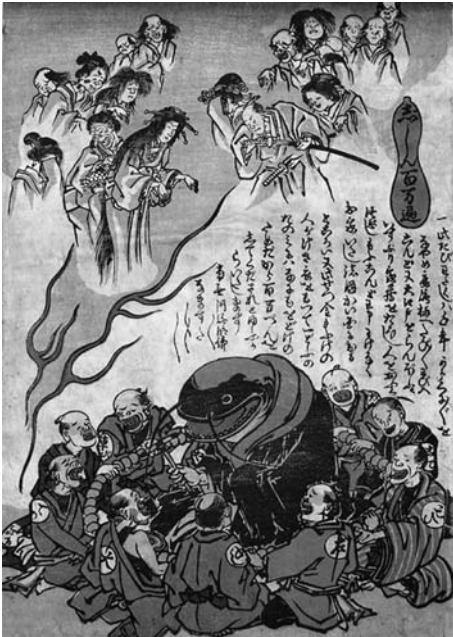
Figure 1 : Namazu-e portrays perils and prosperities ( http : //www.bousaihaku.com/wopen/shake/images/cat17.jpg )

The 1855 Ansei Edo Earthquake and Namazu-e (Catfish prints) : Dutch social anthropologist, Cornelis Ouwehand (1964) conducted comprehensive iconographic analyses of Namazu-e or catfish prints from the 1855 Ansei Edo earthquake period. A big boom of namazu-e printing was one of the most prominent social phenomena after the 1855 Ansei Edo earthquake (Kitahara, 1983 ; 2000). Namazu or the catfish was believed widely to be the causative agent of earthquakes during the Edo period. Namazu-e recorded folkloric accounts of how the Ansei Edo disaster was viewed and thus how its reality was constructed among common people. Like Ouwehand (1964), the social historian, Kitahara (1983 ; 2000) analyzed catfish prints and concluded that namazu or catfish images were portrayed in two manners, one as a messenger of Heaven-sent punishment and the other as a presage of social renewal. Although earthquakes may cause perils, they can also bring about something good (Figure 1), such as the rebalancing of inequalities by bringing wealth to laborers, carpenters, plasterers, craftsmen, lumber dealers, ironmongers, bone fracture doctors and cathouses (Figure 2).