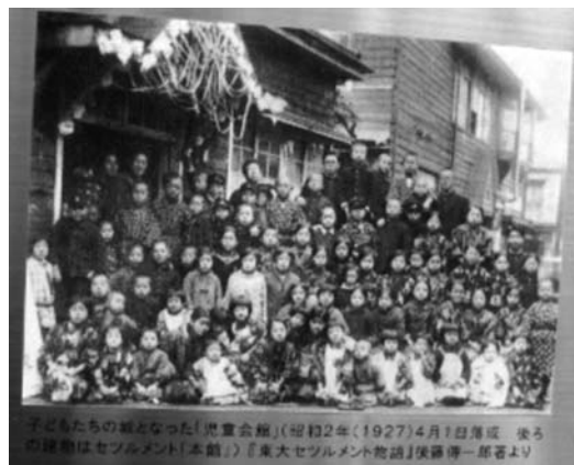
Figure 4 : Children and Volunteers at Tokyo Imperial University Settlement House Day Care Center ( https://ameblo.jp/skytree-sightseeing/entry-10855521401.html , the last accessed on February 4, 2018)