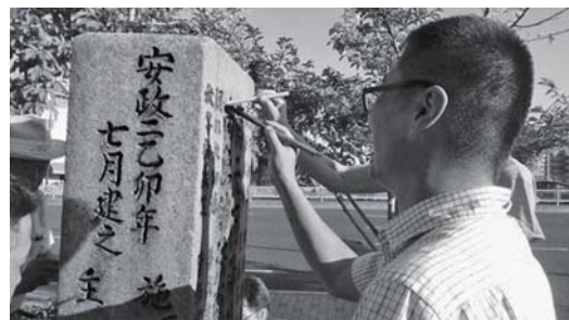
Figure 8 : Tsunami Lesson Ink Brush Tracing at Ansei Tsunami Monument ( https://www.facebook.com/fromosaka/videos/pcb.864778680348342/864778437015033/?type=3&theater , last accessed on February 4, 2018)