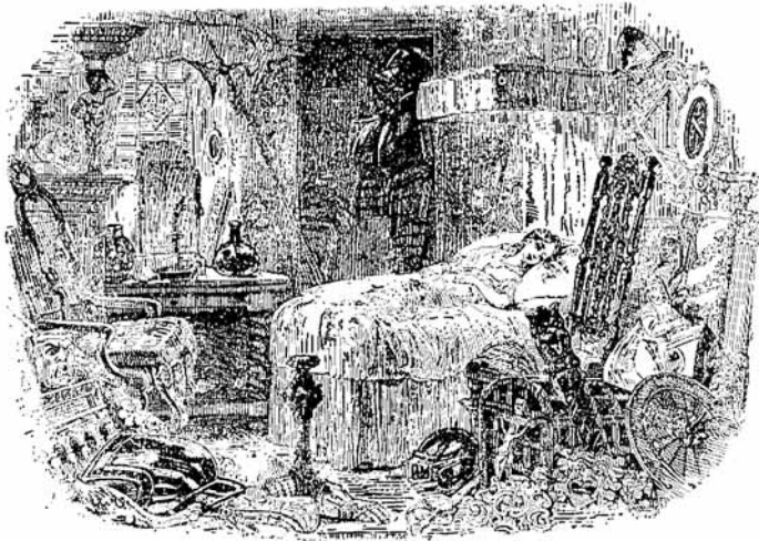
Illustration 1: The Child in her Gentle Slumber