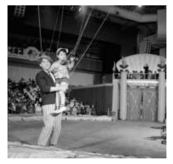
Photo 3. The Little Fugitive. (Reproduction of the still from the film, the courtesy of M.Gorki Film Studio Archives).

The Japanese screen writers based their stories on Japanese admiration for the Soviet school of classical music (Oguni Hideo), the popularity of the Soviet circus, the good reputation of Soviet medical care (Saito Yonejiro), and the mutual aid of Soviet and Japanese sailors in a shipwreck