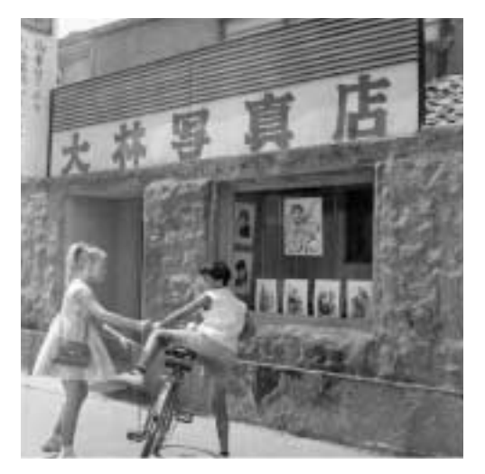
Photo 1. Ten Thousand Boys. (Reproduction of the still from the film, the courtesy of M.Gorki Film Studio Archives).