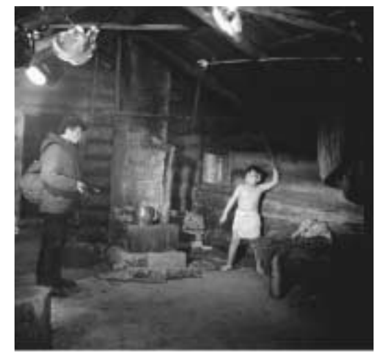
Photo 4. The Little Fugitive. (Reproduction of the still from the production files of M.Gorki Film Studio , the courtesy of Studio Archives)

In the scenario Ken, who returned to Japan after spending 6 years in the USSR, rhetorically asked: "How could my uncle, who loved me, doom an 11-year-old boy to such an ordeal!"<sup>22</sup>. There is no such line in the film; the boy's journey along the Great Siberian Railway is shown as a sequence of funny and touching encounters with different people, who are happy to protect and to help him. But still there is one episode in the movie, which reminds us about what crossing the border of the USSR without permission